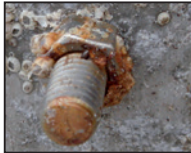
Corroded VA screw in aluminium