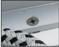
Stainless steel screw aluminium floor rail