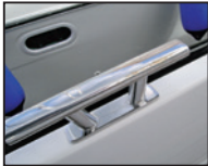
Stainless steel coating on aluminium hull