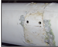
Corroded aluminium mast