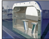
Stainless steel bracket in aluminium shell plate

TIKAL TEF-GEL® is a watertight, PTFE-based paste which prevents the blooming of metal and also reliably prevents corrosion from galvanic flows between unequal metals. In all places where refined metals come into contact with less refined metals (eg. aluminium with stainless steel), a small amount of TIKAL TEF-GEL® suffices to prevent galvanic exchange of electrons and subsequent corrosion.